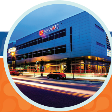
The Hub opened its doors in October 2011

UF Innovate | Accelerate operates two world-class, best-in-class facilities united under one award winning entrepreneurial support organization.